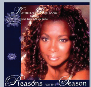
Reasons for the Season